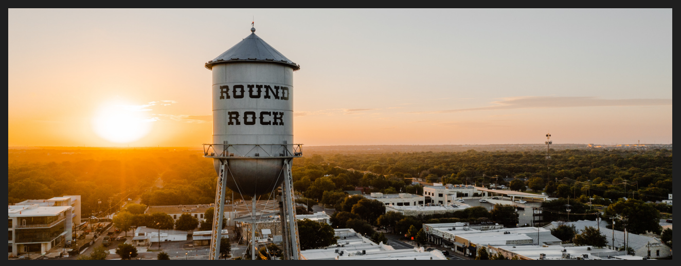
*Data from Round Rock Chamber of Commerce