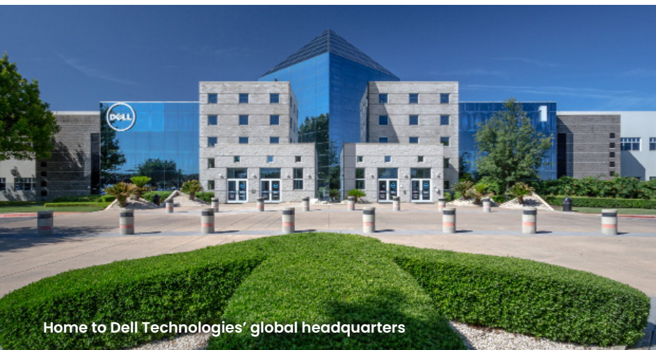
Home to Dell Technologies' global headquarters