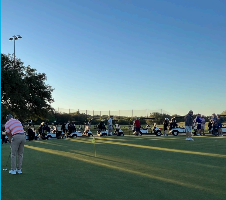
PHOTO BOOTH SPONSOR